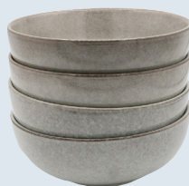
16cm Cereal/Soup Bowls