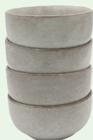
11cm Side/Dipping Bowls