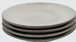
26cm Dinner Plates