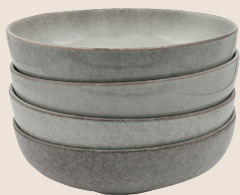
20cm Pasta/Salad Bowls

Other styles available in the Grey Nordic Stoneware range. Available in sets of 4