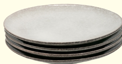
20cm Side Plates