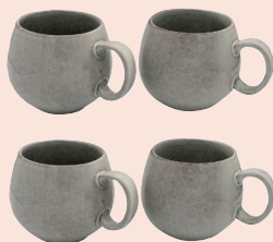
350ml Mug or 490ml Extra Large Mug