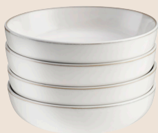
20cm Pasta/Salad Bowls

Other styles available in the White Nordic Stoneware range. Available in sets of 4