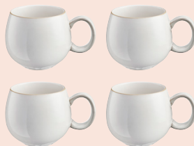
350ml Mug or 490ml Extra Large Mug