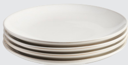
26cm Dinner Plates