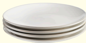
20cm Side Plates