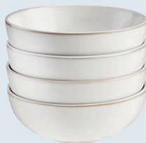
16cm Cereal/Soup Bowls