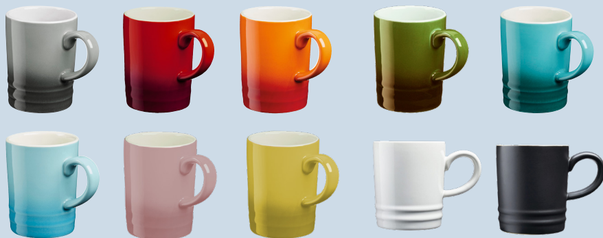
6-Piece and 4-Piece Mug Sets