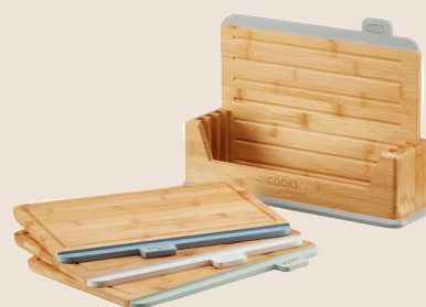
Bamboo Chopping Boards