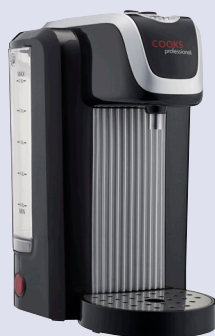
Hot Water Dispenser