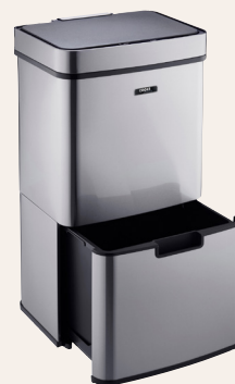
Sensor Recycling Bin