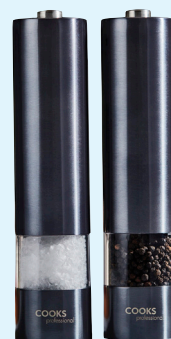
Electric Salt and Pepper Mills