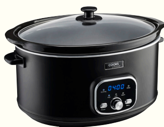
3.5L Slow Cooker