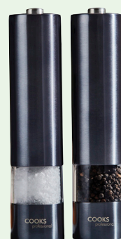
Electric Salt and Pepper Mills