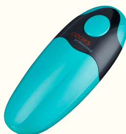
Electric Can Opener