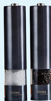
Electric Salt and Pepper Mills