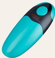
Electric Can Opener