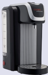
Hot Water Dispenser