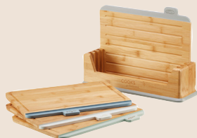
Bamboo Chopping Boards