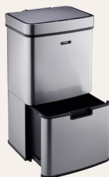
Sensor Recycling Bin